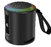
Pebble Bluetooth Speaker